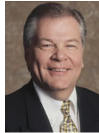
Mayor Patrick Dunlavy

continuing to work on are Phase 2 of the Wastewater Plant expansion. This phase will provide us the capability to handle the bio-solids at the plant in a much more efficient way, saving money and bringing those processes up to date with current technologies. We will also be upgrading the plant facilities, making them safer for our employees and protecting our equipment.