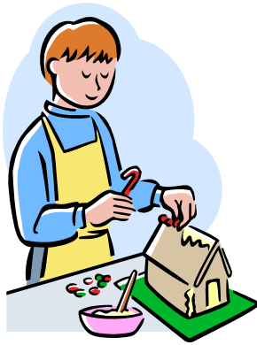
Create your own masterpiece for the Downtown Alliance's "Gingerbread Home Show!"