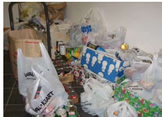
Food collected at city hall by the Arts Council

The T Minus 5 Christmas concert was excellent and provided a great family event for all those that attended.