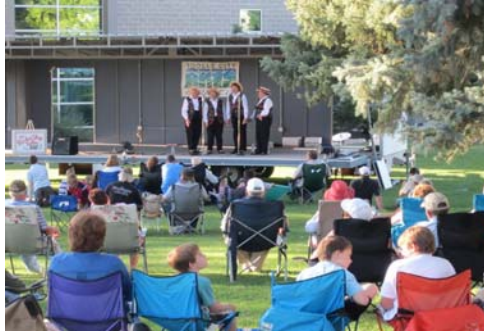
2011 Fridays on Vine