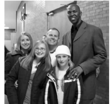
Thurl Bailey signed autographs and posed for pictures at the concert on December 8th.

Thanks to the community for your support of this concert. We certainly filled the auditorium and since the cost per ticket was only a can of food, we helped fill the food bank as well!