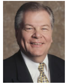
Mayor Patrick Dunlavy